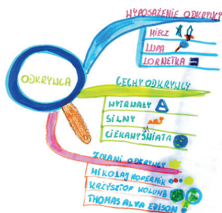
Fig.1. Sample Mind Map: Discoverer (student, 11 years).