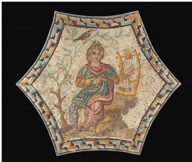
Fig. 11. Mosaic with Orpheus and a bird, Tunisia, 200–250 AD. Museum of Applied Arts in Budapest, Hungary ( https://upload.wikimedia.org/wikipedia/commons/5/58/Orpheus_-_Google_Art_Project.jpg )

Proserpina, was able to overcome the inevitability of death. This episode illustrates the impossibility of the return of the dead to the world of the living, an act that would constitute a dangerous and unthinkable subversion of the laws of the Fate which have to be obeyed also by the gods of Olympus. 53