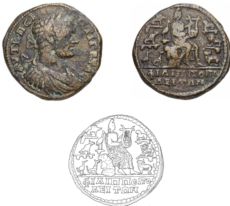
Figs 7 a–c. Philippopolis, bronze, 209–211 AD. Obverse: AVT K II CE-ITTI TETAC. Bust of Geta with a crown and laurel, with armor and mantle, face to the right. Reverse: ΦΙΛΙΠΠΟΠΟΛΕΙΤΩΝ. Orpheus sitting on a rock with the lyre in hand, surrounded by pig, stork, wolf, duck, dog, marten, lion, hare (Berlin, Münzkabinett of the Staatliche Museen zu Berlin, IKMK 18200873; www.smb.museum/ikmk/object.php?id=18215944 ; drawing from the reverse by Fiammetta Sforza)

sitting alone on a rock and holding a plectrum raised in his right hand and a lyre in his left hand, a gesture that indicates the beginning or the end of a song (fig. 9). This position can be also found in Roman mosaics and early Christian frescoes. 48