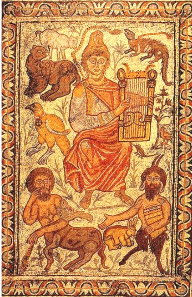
Fig. 3. Jerusalem, fragment of the Orpheus Mosaic from a funerary chapel, Necropolis at Damascus Gate, 6th century AD. Istanbul, Archaeological Museum (from OLSZEWSKI [n. 8])