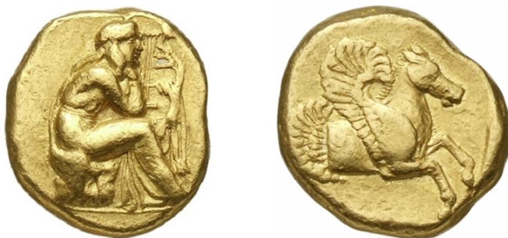
Figs 5 a–b. Golden stater from Lampsacus (Mysia), 350–340 BC.

Obverse: Orpheus in Thracian clothing and Phrygian cap, is sitting on the right on a rock. He supports his chin with his right hand put on the knee and with the right hand he holds the lyre with long branched arms, from which hangs a band.