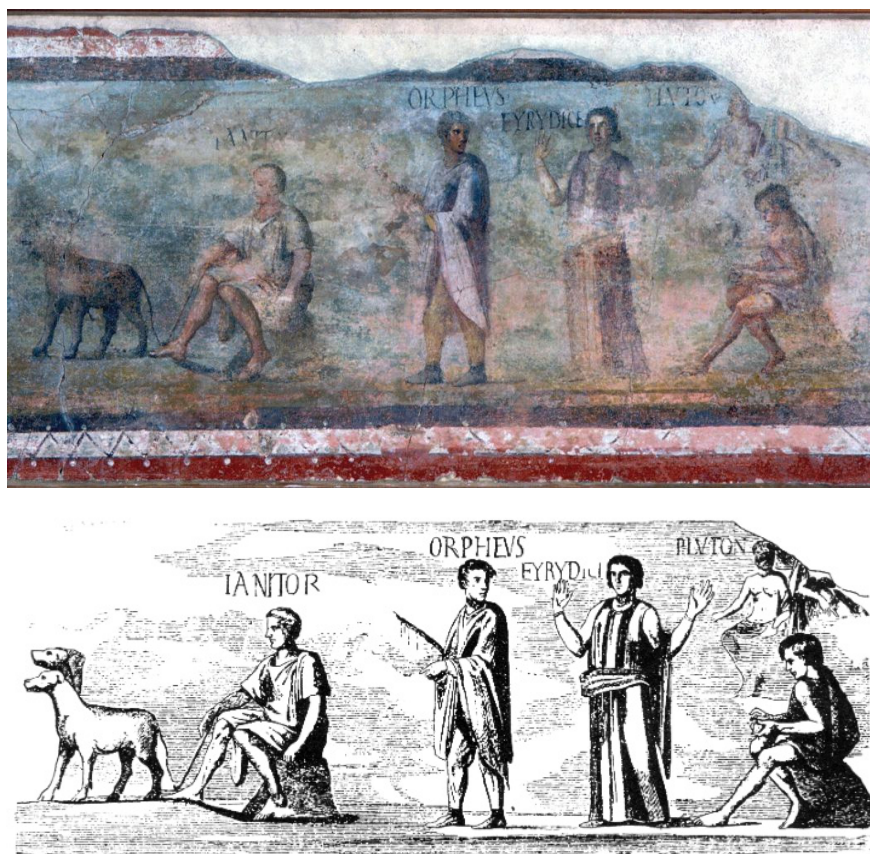
1. Orpheus und Eurydike, anwesend: Kerberos, Ianitor Orci, Pluton, Grabgemälde aus Ostia (nach M&A, www.majcar.com )

Fig. 2a–b. Ostia, Necropolis of via Laurentina, colombarium of Decimus Follus Mela, half of 2nd century AD. Orpheus and Eurydice in the Underworld, with Cerberus and Hades. Vatican City, Vatican Museums, The Gregoriano Profano Museum (from L'età dell'angoscia. Da Commodo a Diocleziano. 108–305 d.C. [catalogue of the exhibition]. Roma 2015, 321; drawing in ROSCHER, W. H.: Ausführliches Lexikon der griechischen und römischen Mythologie . Bd. III. 1884)