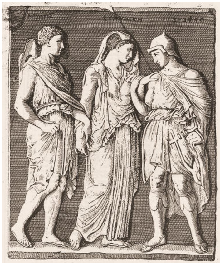
Fig. 13. Torre del Greco, Contrada Sora, Roman villa. Drawing of a marble relief with Orpheus, Eurydice and Hermes. The copy dating back to the times of Augustus, of the Greek original from the end of the 5th century BC, Phidias's school. Naples, National Archaeological Museum (from MEOLA, G. V.: Alcuni monumenti del Museo Carafa . Napoli 1778, tav. XIV)

After definitively having left Eurydice in the Underworld, Orpheus moved away from love for other women and, following various circumstances (given the different literary traditions), was killed by the ferocious fury of the Thracian women and/or by Maenads, who tore his body apart. His head and lyre, thrown into the Ebro, reached the sea and from there they landed at Methymna, on the island of Lesbos, preserving the talent of prophesy. The islanders praised them as objects of worship, making the island the homeland of poetry. 58 In the end – and this time rightly so – in the Under-