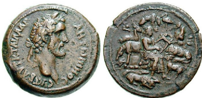
Fig. 6. Alexandria. Bronze drachma of Antoninus Pius, 141–142 AD.

Obverse: AVT K T AIA AAP ANTΩNINOC EVCEB. Bust of the Emperor.