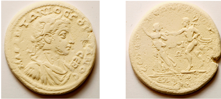
Fig. 14. Cilicia, Seleucia ad Calycadnum. Bronze coin of Marcus Antonius Gordianus Pius, 238–244 AD.

Obverse: MAP ANTΩNIOC ΓΟΡΔΙΑΝΟΣ CEB Bust of the Emperor.