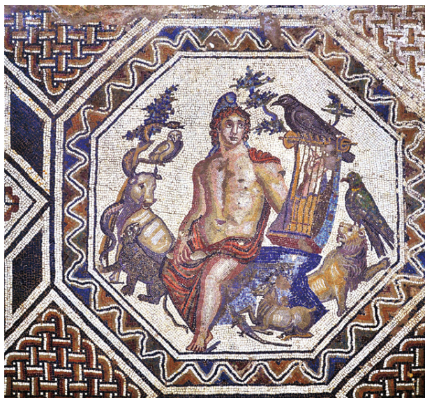
Fig. 4. Turris Libonis (Porto Torres, Sardinia. Archaeological Parc Antiquarium Turritano). Domus of Orpheus, 1st century AD, mosaic pavement with Orpheus among the animals ( www.comune.porto-torres.ss.it/Comunicazione/Argomenti/Porto-Torres-Turismo/Da-visitare )

frescoes, on sarcophagi, lamps, mirrors, gems, glasses and also other works of art. Orpheus appears either as a singer, with the Argonauts, in the Underworld, as protector of the deceased, with his bride Eurydice, at the moment of his death, or just his prophetic head with a lyre. 21