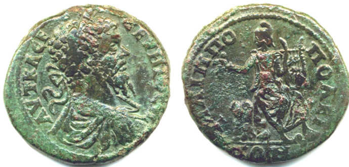
Fig. 9. Philippopolis (Thracia). Bronze coin of Septimius Severus. Obverse: ΑΥΤ Κ Α ΚΕ ΚΕΥΕΡΟC. Bust of the Emperor. Reverse: ΦΙΛΙΠΠΙΟ ΠΟΛΕΙ in exergue ΤΩΝ. Orpheus, sitting on a rock, holds the lyre with his left hand and a plectrum with his right hand ( www.forumancientcoins.com/gallery/displayimage.php?pid=30261&fullsize=1 )